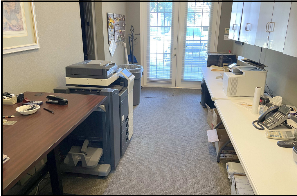
REAR ENTRANCE - WORK ROOM

Gary Vasseur gvasseur@vasseurcre.com www.vasseurcre.com